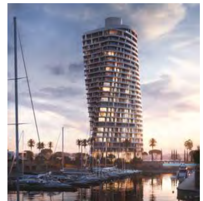
Truly World-class yachting facilities.